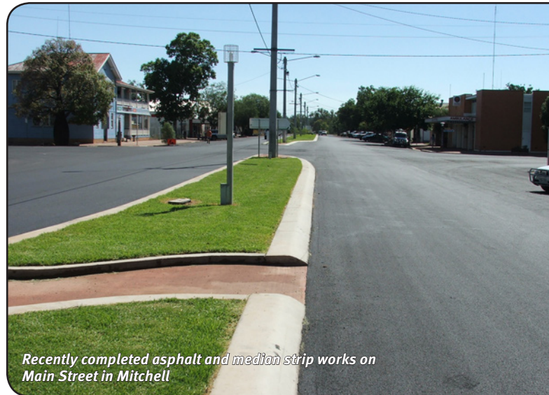
Recently completed asphalt and median strip works on Main Street in Mitchell

Click on road projects and sort by South West Region.