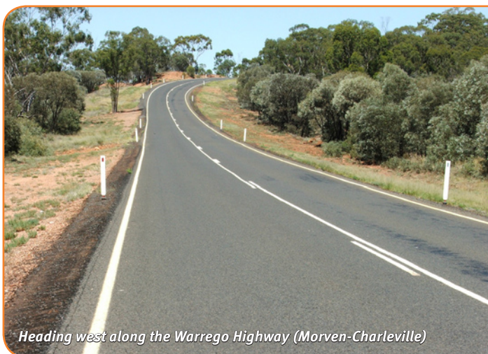
Heading west along the Warrego Highway (Morven-Charleville)